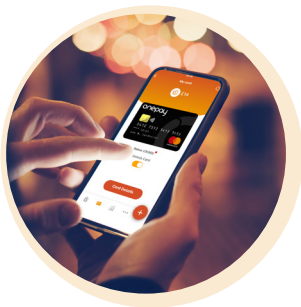
Приложението „My OnePay“