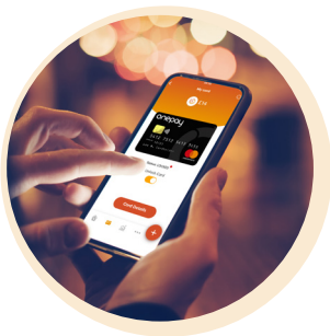
'My OnePay' app